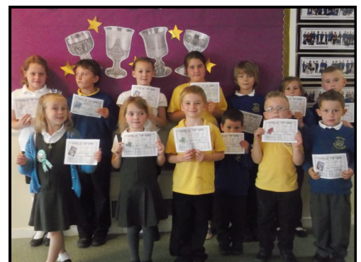
We are the Pupils of the Week