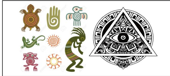
An example of Aztec pottery